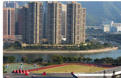
11. View of Shing Mun River Channel