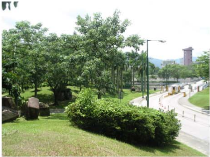
4. View of garden at HKSJ entry