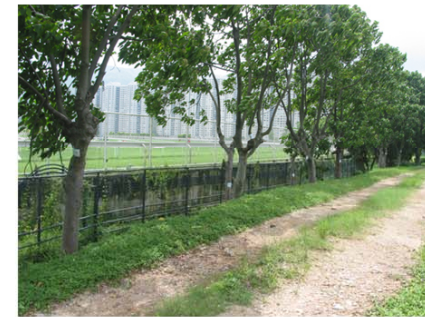
10. View of existing trees along edge of golf driving range