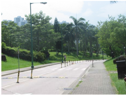
5. View of garden at HKSJ entry