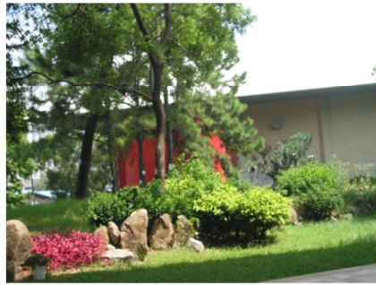
2. Garden at VIP Entry