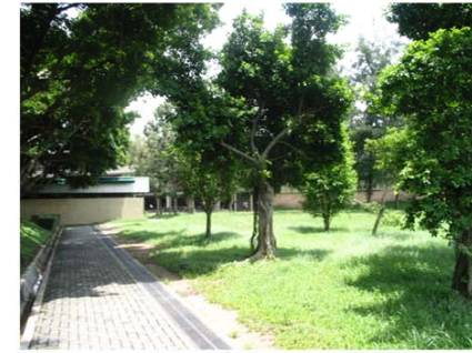
8. Trees at existing indoor pool