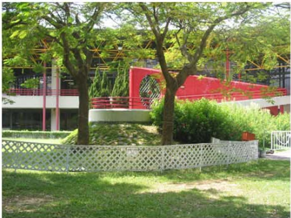
6. View of garden adjacent HKSJ indoor sports complex