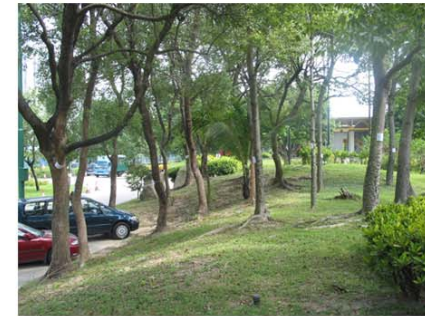
9. Trees next to access road parking