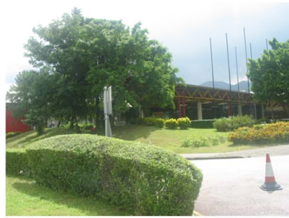
3. View of VIP Entry garden from carpark